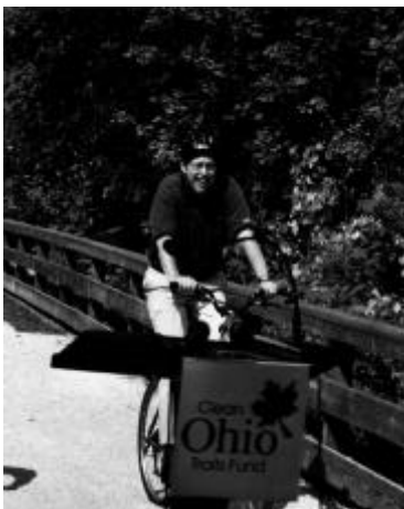
Gov. Taft bikes in on the Towpath to announce the good news.

Phase II of the towpath will ultimately provide the ADA and bike connection. It will follow the innerbelt to the west ... traverse the Innerbelt... dip behind the Civic Theatre and also connect with Lock 3.