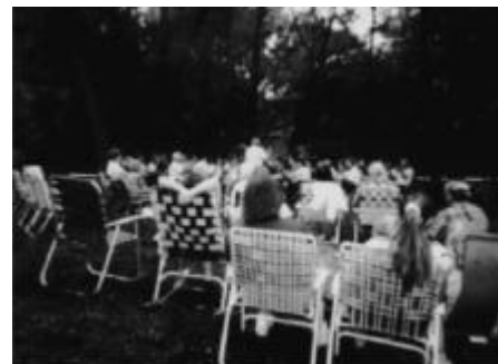
CLPA members enjoy a relaxing evening with the Goodyear Community Concert Band