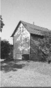
An anonymous artist's creation at the historic house on Canal Street (other side faces Howard Street)

It's really quite incredible. Having received a $25,000 planning grant from the Ohio & Erie Canal Association (OECA), Cascade Locks Park Association (CLPA) has become pivotal in the planning process for one of Akron's two heritage corridor "nodes". These nodes, or linkage centers, are significant components in the corridor's master plan.